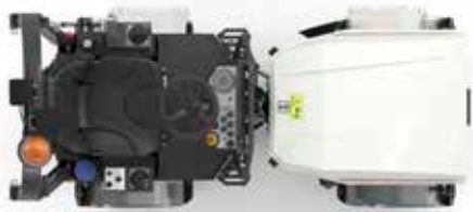
In-line "one-side-free" configuration